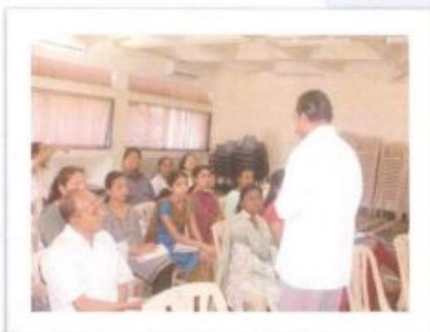
Finance management training at Sarvodaya Mumbai

OUTCOME: All 15 partners are accounting their projects on Tally ERP 9 software.