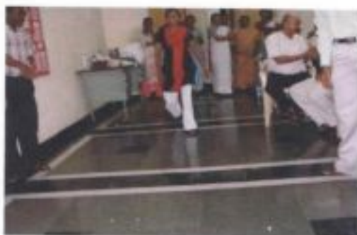
Regional Level PRI

Being the capacity building and facilitating organization the WRSSF organized a series of training at regional and zonal level on Panchayati Raj for Development at the grass root level. Panchayati Raj Institutions are made responsible for the development in the villages. It is a long term and continuous process, which demands people's participation, requires awareness and access to education and training of common people to demand their rights and for elected members to perform their work effectively.