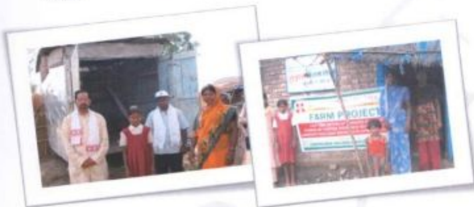
Starting of IGP in a rented shop

An old second handed petty shop purchased with the income from IGP