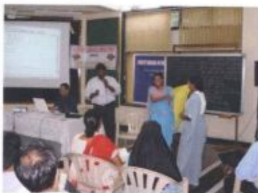
Regional Level PRI workshop in Mumbai