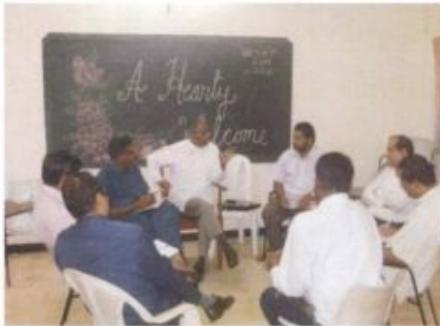
MUMBAI: 12TH OCTOBER 2009

Zonal Coordinators meeting: The zonal coordinators are the working group of the Forum. Two meetings were organized for the zonal coordinators at Sarvodaya Mumbai. The meeting in October was organized for the zonal coordinators to discuss what roles the coordinators would be playing in the FORUM programs. First of all the Zonal Coordinators need to understand the structure of the forum. Therefore they were explained the framework of the Forum.