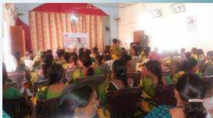
Awareness Program on HIV / AIDS being conducted By NMSSS for Women.

Health - One of the key priorities of NMSSS as an organization has been the health of the people where it serves. The operational areas have the unfortunate tag of faring poorly in the specific area of HIV/AIDS. Health education program was conducted by NMSSS where health education was given to women related to HIV and AIDS. It's causes, sign and symptoms investigation and treatment were discussed. Preventive measures of HIV were also explained in detail.