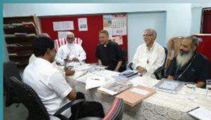
WRSSF Governing Body electing new trustees

Venue: Diocese of Ahmedabad, Nadiad, Gujarat | Date : 9th December, 2016