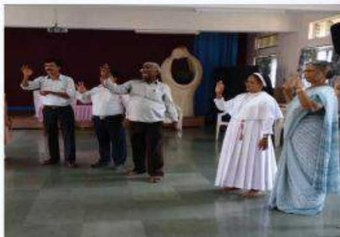
Workshop on Preventive Health care organized by WRSSF

Venue :Atma Darshan, Andheri (E) | Date : 27th to 28th September, 2016