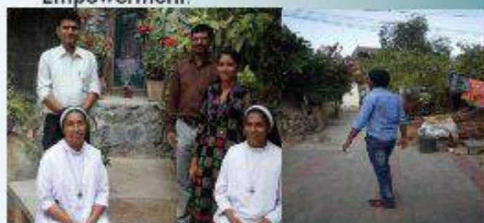
At the Social Service Centre Nishkalank Welfare Centre, Ranpar Gujarat under Navjeevan Trust Rajkot Gujarat.