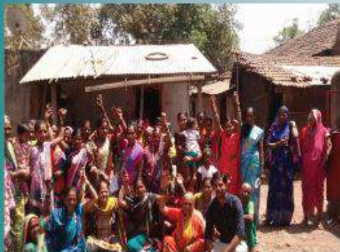
Women's from Narewadi Village, Satara raised voice against negligence of water problem of Gram Panchayat

Water Issues – With the support provided by PDSSS team villagers from Koundani Village, Morewadi village and Narewadi village come together to solve the water scarcity problem. In Narewadi Village Women raised voice against negligence of water problem of gram panchayat. Gave application to gram panchayat and demanded to take action as early as possible on the water problem. Morewadi Villagers come together and through the support of PDSSS team gave the application to Zila Parishad, Satara for the pipe line. After strong follow up and demand of people govt. sanctioned pipeline in the village. In Koundani village 55 villagers come together and dug water tube well through the contribution and make assured source of water for the villagers