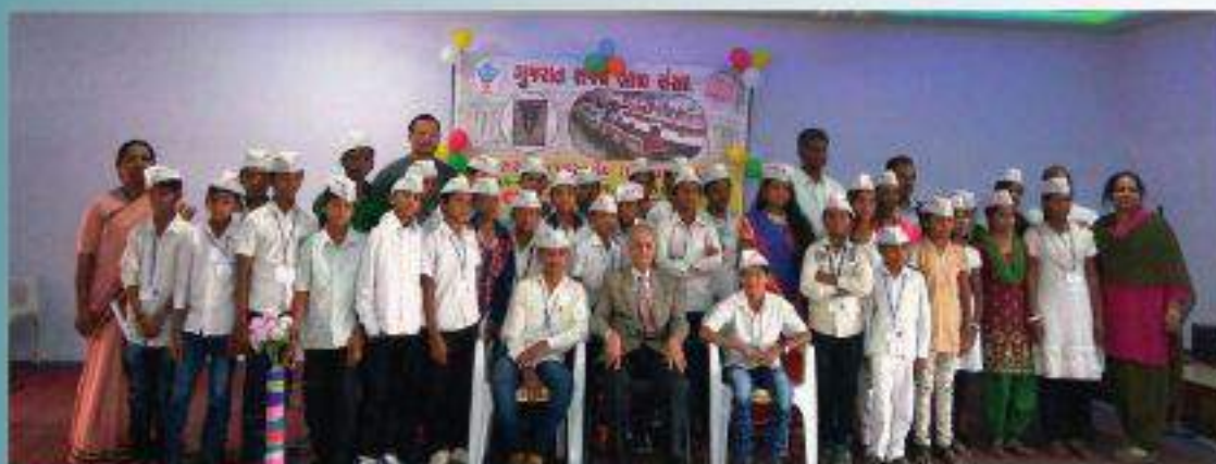
State level BAL Sansad organized by KSSS, Ahmedabad