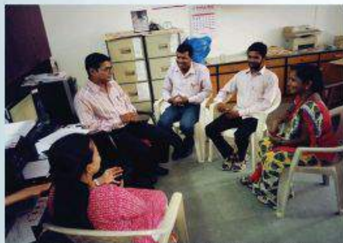
WRSSF conducted training on CSR Connectivity for Vasai Diocese staff

WRSSF Organized a half day training session on the concept of CSR Connectivity for the staff of Vasai Janhit Trust at Bishop's House Vasai, Dist. Palghar. The objective being making the concept of CSR Connectivity clear to them, the short session was well received by the participants. Each of the participants were assigned a task to do, which would be reviewed in the Zonal level CSR Connectivity training program