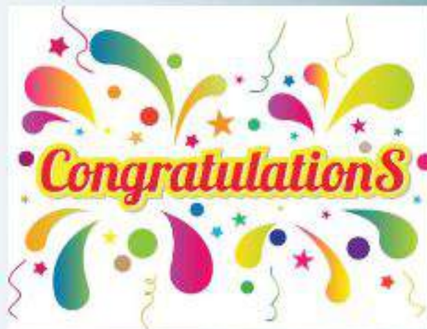
Kaira Social Service Society celebrated their Golden Jubilee Program

It's very heartening to express our "Congratulations" to our Partner Kaira Social Service Society and its highly dedicated team for completing 50 years of dedicated social service to the region of the diocese of Ahmedabad. WRSSF was there to celebrate the