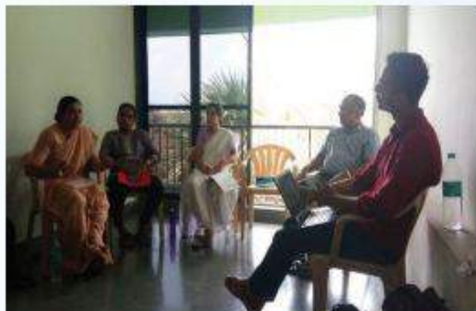
Training on CSR Connectivity, Capacity Building and Media Visibility

Venue: Sarvodaya, Goregon (E) | Date: 29th & 30th May 2017