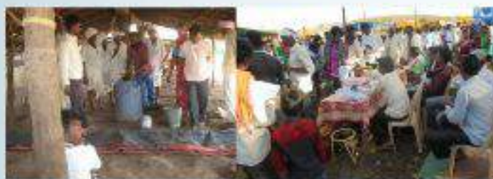
Organic Farming Promotion and Exhibition

Organic Farming - A two day Organic Farming Promotion and exhibition was organized by Jeevan Vikas Sanstha, Amravati. Every year Jatra is organised in Kara and Kat villages during Holi festival which was a golden opportunity for JVS to organise Organic Farming Exhibition through posters and success stories of the farmers who are promoting Organic Farming in their land. JVS set up stall with banners, posters, handbills and some practical materials for the