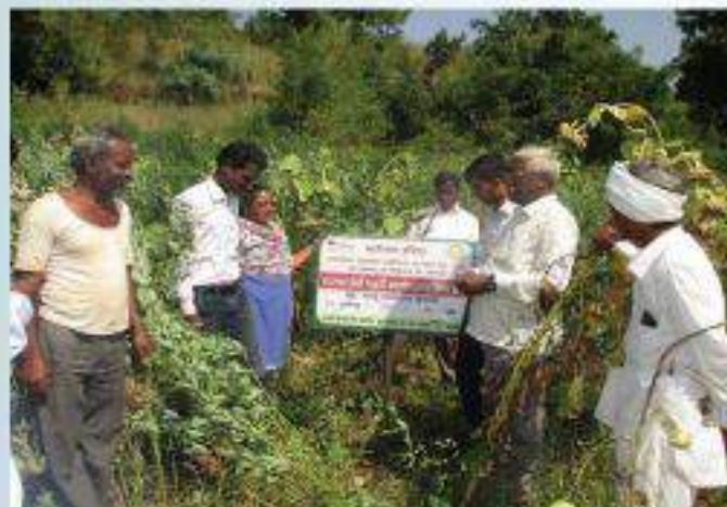
Exposure visit to Chikhaldra

There was an exposure visit to Chikhaldra which is 25 kms from the Paratwada. The Strawberry Garden in Chikhaldara was the point of attraction. The participants also visited Social Environment Study Centre at Malkapur. Demonstration on Beejamrut