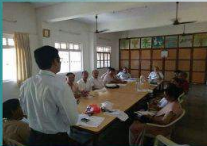
Partner Support Officer representing WRSSF at the CDC meet at Vasai

Venue: Bishop's House, Vasai | Date : 27th March, 2017