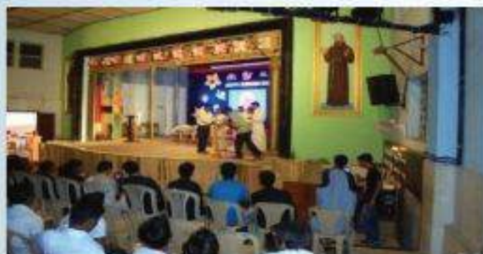
Celebrating Children's day

The leaders of the tribal hamlets govern the village programme, even family programmes. Vasai Janhit Trust has recently tapped them and regularly conducts their meeting at a region level. Thus has helped so far to bring certain changes in their traditions and culture. Besides the above mentioned main activities pension yojna, LIC, Atma project and other Government schemes are encouraged. Thus a lot of farmers and poor families have benefited.