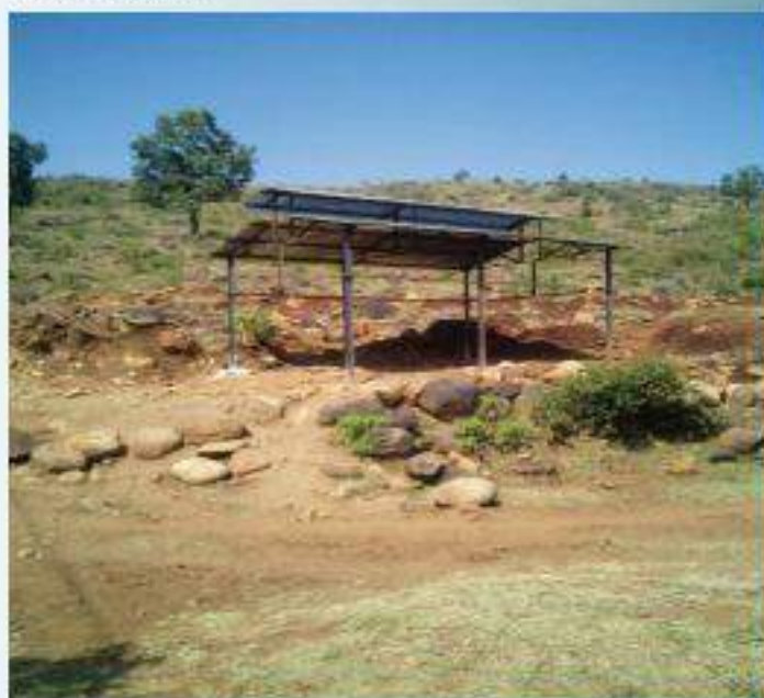
Structure of Samshan Bhumi

Samshan Bhumi - Narewadi village is situated on top of the hill of Western Ghat, Sahyadri mountain range in Satara district Maharashtra having 60 households. Peoples livelihood depends on agriculture and animal husbandry. Rice, Jawar, millets are the main crops cultivated in the area. In Narewadi villages villagers came together for taking important decision and decided to build Samshan Bhumi for dead people through community contribution. People started to come together and make plan about how can villagers contribute in the work and decided every families in the village will give work contribution for construction and allot the work for villagers, community collected available resources and material used for construction, and participated in community work. As a result the structure of Samshan Bhumi got ready through the active guidance and support provided by PDSSS team.