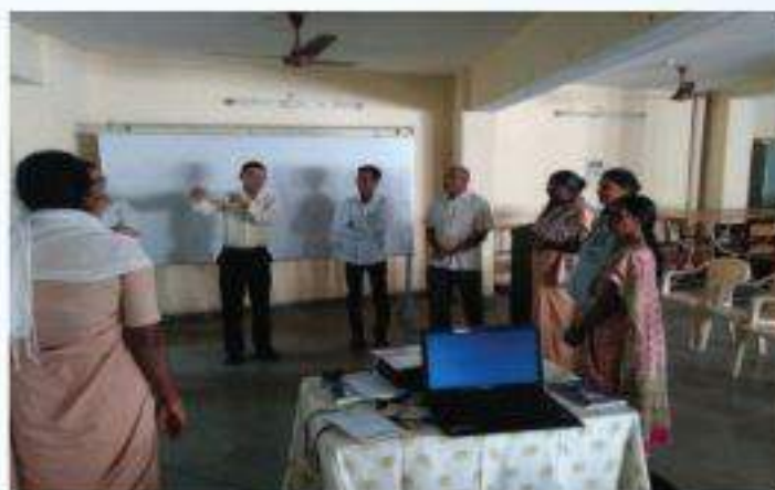
WRSSF Partner Support Officer facilitating the Associate Partner Meet at ADSSS, Aurangabad - December 2016

Venue : Aurangabad Diocesan Social Service Society, Aurangabad | Date : 12th & 13th December, 2016