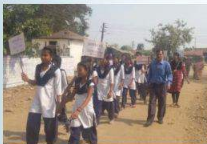
Rally on Importance of Gramsabha conducted by NMSSS

Sustainable Agriculture – NMSSS has spread the awareness on organic farming and its benefits. 63 farmers are practicing traditional farming methods in their field. 38 farmers have prepared organic manures to minimize the input cost. 19 people are cultivating organic vegetable this year