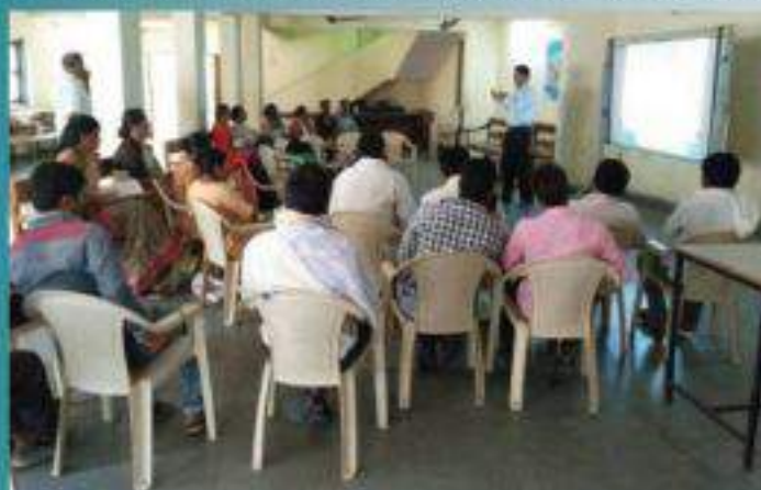
WRSSF conducted training cum Review Meeting for Marathwada Region at ADSSS

Venue : Aurangabad Diocesan Social Service Society, Aurangabad | Date : 23rd May 2017