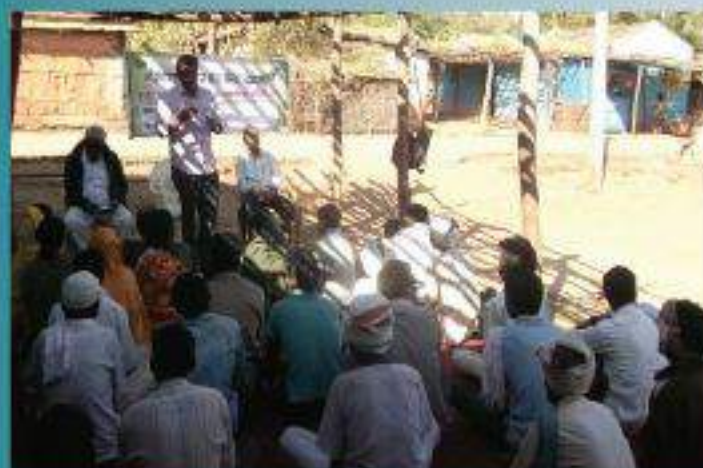
Training on promotion of systematic farming

Livelihood Development Program –LSSS has focus on livelihood development focusing on organic farming by conducting various awareness programs as Training cum Exposure & demonstration of non-farm based practices, awareness & promotion of organic farming by rally, Training on promotion of systematic farming, Training on special Schemes (Govt. Schemes) MGNREGA, Social Security, Agriculture, Livestock's, Promotion of Sustainable, affordable & nature friendly agriculture etc. The result of which that a lot of awareness had been generated among the farmers and they are cultivated cash crops like chilly production with organic farming, cotton crops, some farmers cultivated mix cropping (Jowar, Mize, Soyabin, Beans, Ambadi, Bhendi)