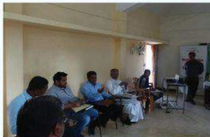
WRSSF Partner Directors Reflection Meet

Venue: Sindhudurg Diocesan Development Society, Sindhudurg | Date: 22nd & 23rd February, 2017