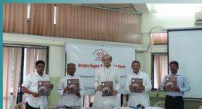
Figure His Eminence Cardinal Oswald Gracias releasing the Annual Report of WRSSF

Venue: Sarvodaya, Mumbai | Date: 6th July, 2016