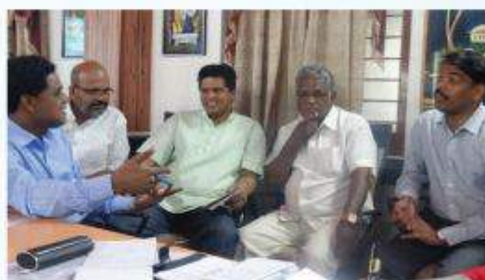
Partner directors having group discussion on WRSSF Strategic Plan

Venue: Pastoral Centre, Bhopal | Date: 19th to 21st April, 2016