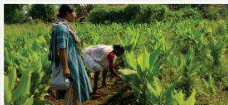
Turmeric farming promoted by CSA