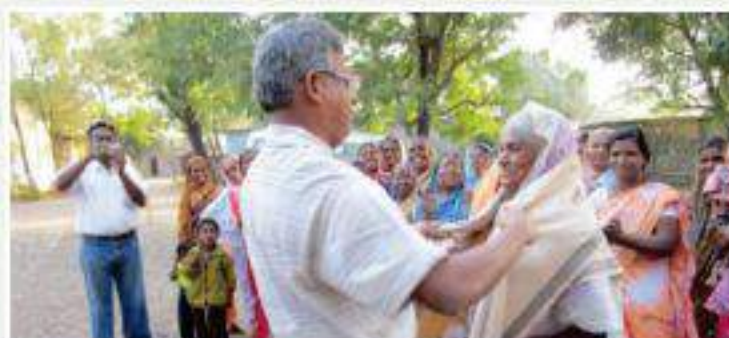
WRSSF Director's interaction with the villagers in Ahmednagar District

13 th March 2013: Participated in the Caritas India new Policy Finalization workshop, New Delhi