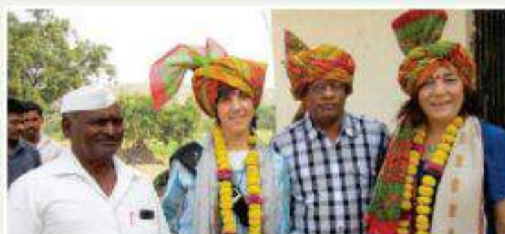
Representatives of Manos Unidas with WRSSF Director during their field visit in Ahmednagar