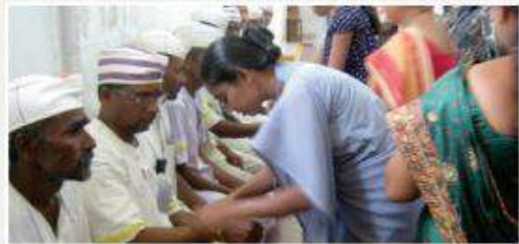
A Religious sister tying a Rakhi's to the prisoner.

The prison ministry program run by NSSS is one of the stand-out programs in Dioceses on Nashik. This program was initiated by NSSS at the central prison, Nasik. It is a collaborative venture by volunteers, social workers of NSSS, teachers and psycho-social counselors. During the past year, 250 children of the Anganwadi in the central prison were supported with child-care and education and 300 Prison inmates were counseled.