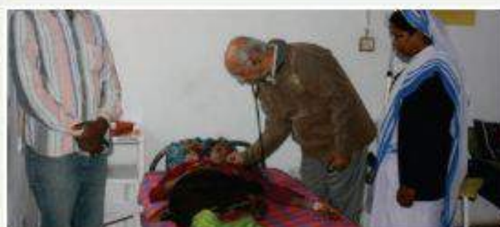
Medical care given to patients through SSSS