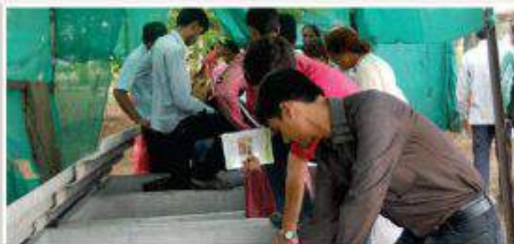
Volunteers take a look at the vermin-composting bins