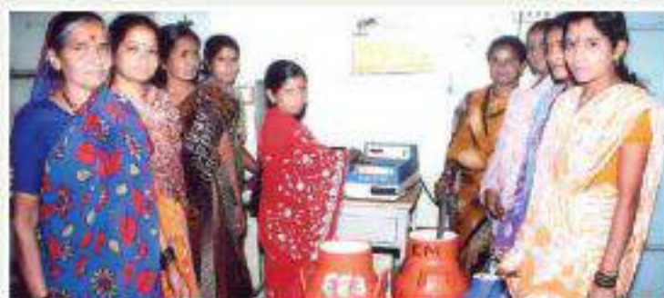
A Dairy Project taken up by the village Women SHG

Farming etc, the economic status of village women has improved. Through the guidance of organization staff, women from Dabawadi village have started Milk co-operative which has helped to generate additional source of income for them. Through the guidance of PDSSS, five SHGs were selected by Panchayat Samiti for Rajmata Jijau Award in 2012.