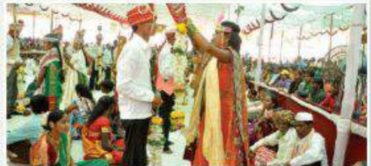
A wedding is in progress at the Samuh Vivah organized by the Karunya Trust, Kalyan

During the function, the diocese of Kalyan handed over the keys of 30 houses constructed for the poor and needy in the rural areas of Ambarnath, Bhiwandi and Kalyan Taluka. This is a part of social project for the rehabilitation of the poor in the area.