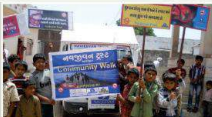
Children conducting a community walk in their village

Navjeevan Trust works with the downtrodden and marginalized, mainly women, children, HIV infected and affected, orphans and semi orphans, youth, migrants, marginalized farmers, SC, STs and OBCs. Navjeevan Trust believes in working for the integral development of the poor and marginalized to lead them towards a dignified and liberated life through empowerment through a rights-based approach.