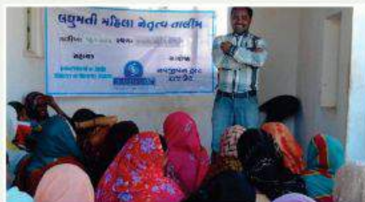
A women's leadership program underway