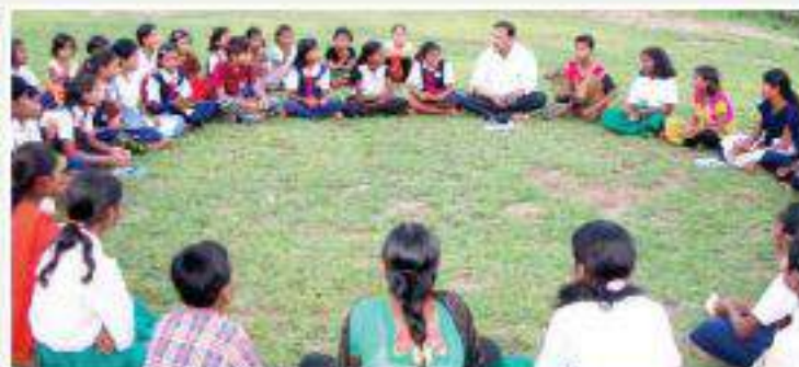
Outdoor activity with children for interaction