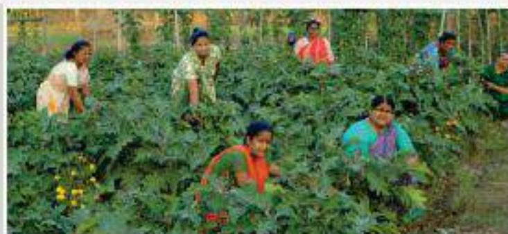
Brinjal cultivation by SHG