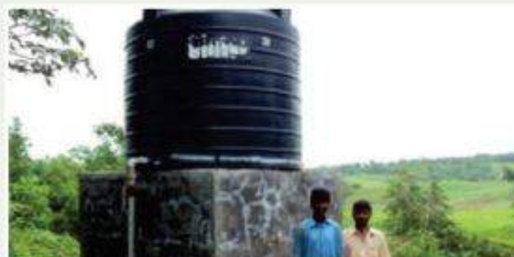
A water tank built in a village by KVM