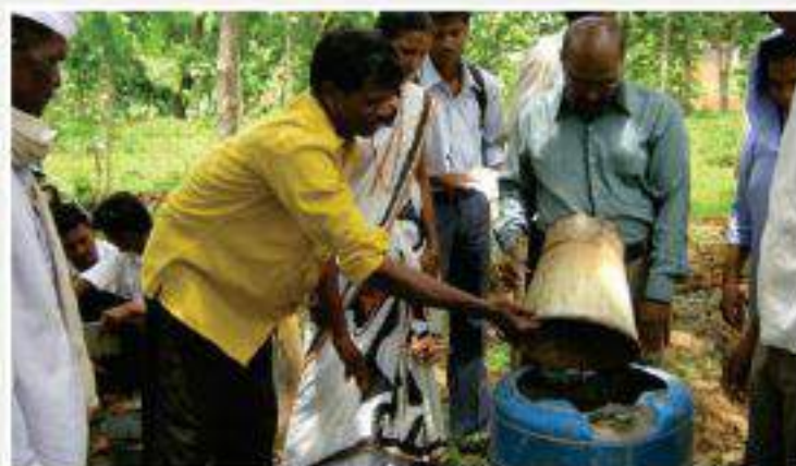
Preparing Jeevamrut – organic fertilizer