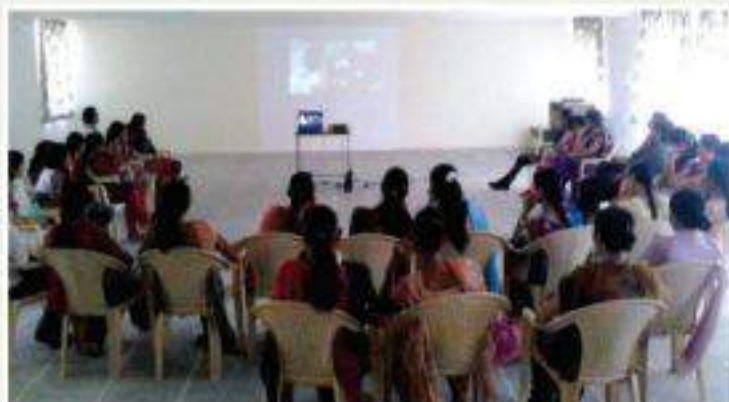
Screening of an Environmental awareness documentary