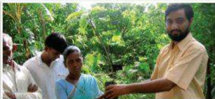
VJT team member interacting with the farmers

96 SHGs, 10 farmers clubs are in the process, 2 youth groups & 38 Income Generation Programmes (IGP) are running today. There were various programs conducted among the tribal villages and hamlets. There were programs and on mother and child health, sustainable agriculture, kitchen garden demonstration and linkages to various social welfare schemes and reforestation campaigns etc.