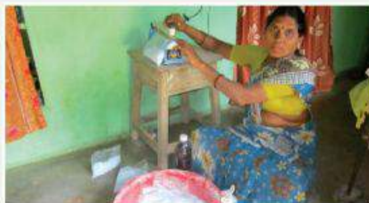
A livelihood opportunity created through Income Generation Program.