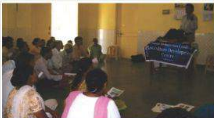
A Disaster Management Workshop in progress

During this year, with the financial assistance of Manos Unidas, KSSS has initiated a new project in 15 rural villages like Dholka, Bavla and Dhandhuka belonging to the district of Ahmedabad.