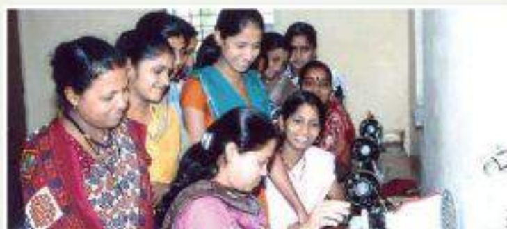
A group of women undergoing tailoring classes