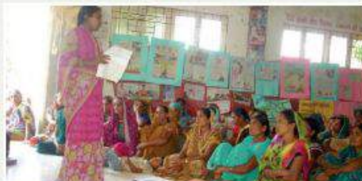
Women being trained on Panchayati Raj

To build up the capacity of VDC and people, they have provided various kinds of trainings to VDC's like leadership trainings, village development micro planning, women in Panchayat Raj etc. Over 4219 men and women have participated in 221 trainings conducted last year. The Project has helped villagers to diversify their resource base as and when possible. In centres like Zankhvav, Umarpada, Dediapada, Unai, Pimpri, Dadwada, Bardipada, the resources mobilized there by the VDC's have cost Rs. 1, 79, 30, 290 totally. This amount has been used to provide facilities like Hand pumps, NREGA, Tar/RCC roads, water tanks, water boring pumps, Panchayat hall, seed distribution etc.