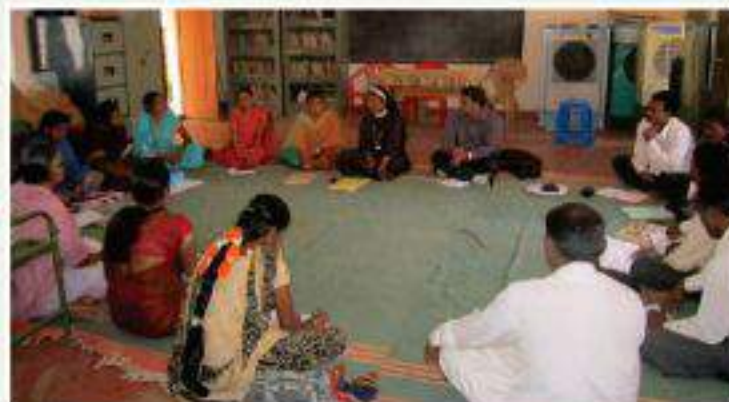
WRSSF staff leading an animators meet of various programs