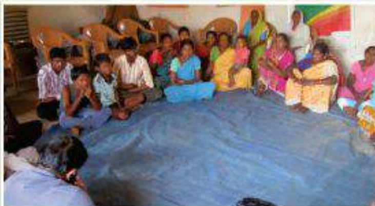
WRSSF staff interacting with the villagers

W estern Region Social Service Forum has been able to undertake fruitful partner support visits in the year 2012 – 2013. The outreach activities have taken place through the length and breadth of whole western region; from the magnificent Sahyadris to the vast farmlands of Vidarbha, from the vibrant land of Gujarat to the farthest fishing hamlets of Konkan. WRSSF has strived towards the acceleration of humanitarian development by extending greater assistance in program and organizational development. We present a few glimpses of our visits before taking you on a journey showcasing the hard work of our partners.