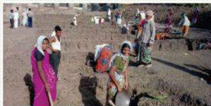
Villagers building canals as part of Drought relief program