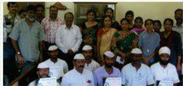
NSSS Director with the prison inmates during a social gathering