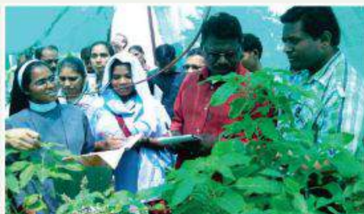
Herbal garden at CESSS Centre in Malkapur, Amravati