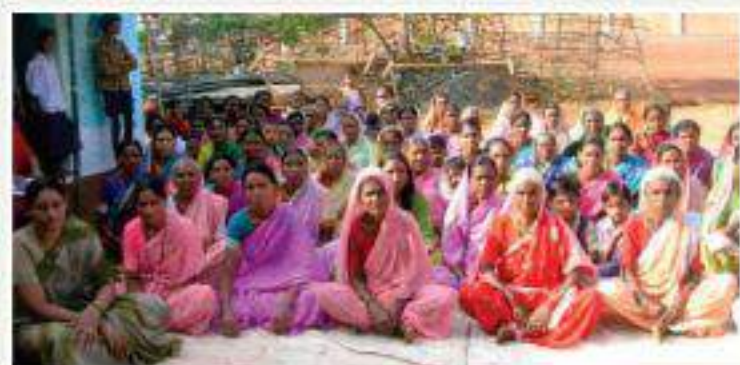
A village level SHG training in progress

towards strengthening and formation of new SHG's in the area. The SHG's have been introduced to various Government Schemes, Inter- loaning and records keeping facilities. Through the various other awareness programs like leadership, skill development, capacity building and entrepreneurship some changes are seen in their lives. Most of the SHGS are participating in the gram sabha and submitting the applications regarding their problems. Through this self sufficiency program, women's thinking pattern has changed over a period of time. Over the last year, LSSS has emphasized on initiating new ventures via the SHG's. LSSS has been influential in supporting the SHG's to avail loans for agricultural purpose and setting up ration shops in their area.