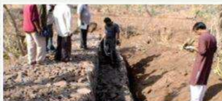
Earthen check dams built in the village by SSSS

SSSS has embarked upon various programs like CBDM, Safe motherhood, Early childhood and Development and Empowerment. CBDM on one hand combats drought and its adverse effects and on the other hand, promotes integral development.