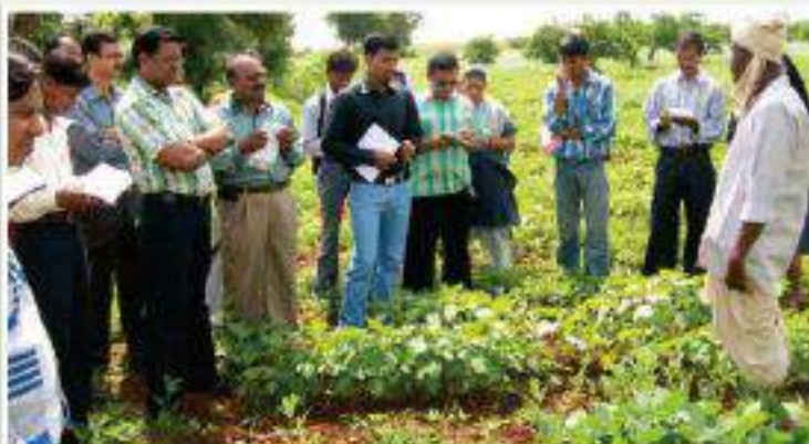
Workshop on organic farming and soil conservation